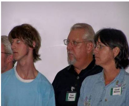
MK graduates recognized at our annual training meeting in Johannesburg, South Africa.