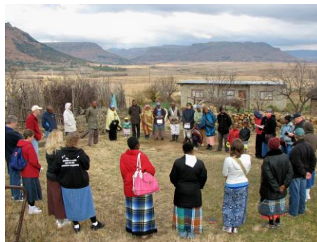
Lesotho volunteers assemble with village church before prayer walking