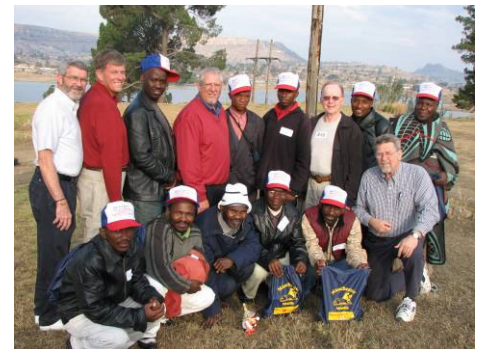
Men's Bible Conference led by volunteer team.