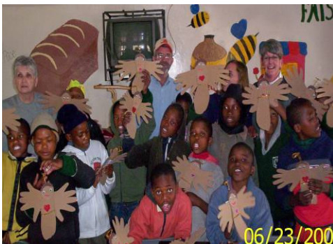
Many orphans were totally blessed by the team VBS. Thanks to all who contributed to this project!