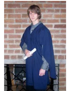
Class of 2009