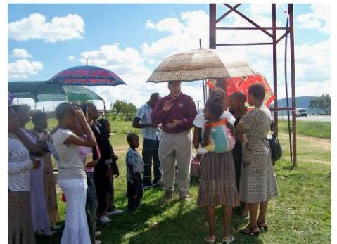
After prayerwalking, the church gathered to share testimonies of their experiences.