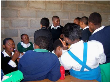
True Love Waits Club prepare skits illustrating ways to avoid tempting situations.