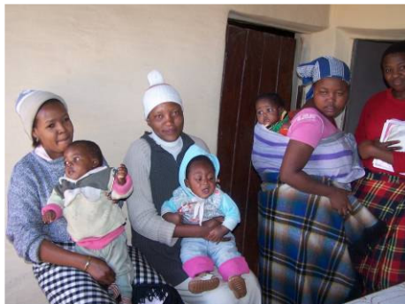
The ladies (Bo-Me) bring their babies to the Bible study.