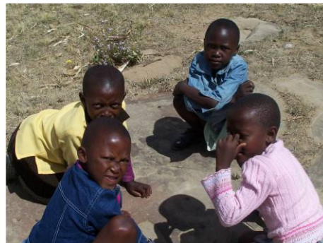
While waiting for church to start, girls (Banana) play a game with rocks.