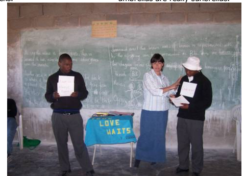
A TRUE LOVE WAITS Club in full swing.