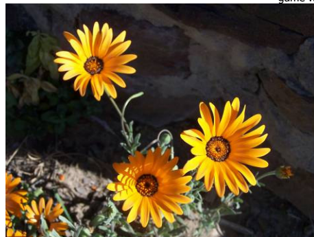
Spring has arrived in Lesotho.