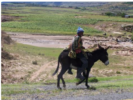
This Basotho boy is happy his family has a donkey to transport a heavy bag of corn meal.