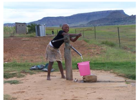
Pumping water from the village tap is a daily task for most Basotho girls.