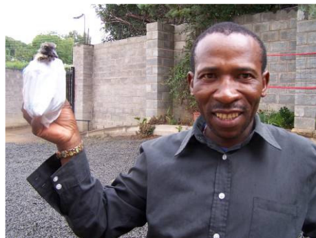
You know you're in Africa when... a baby pigeon found on the roof of our house becomes a bag lunch.