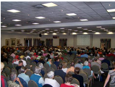
"To The Edge 08" Annual Missionary Training Johannesburg, South Africa, March 24-28.